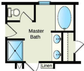
Master Bath Option